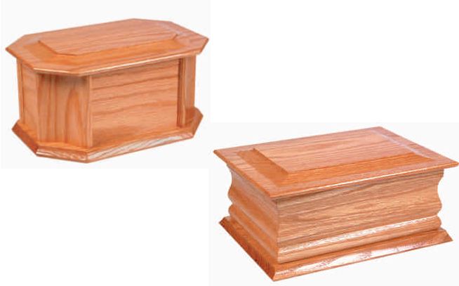
Traditional solid oak ashes casket available in Light Oak and Golden Oak and choice of design.

Our Cremated Remains Urns are hand selected, picking only the best quality and environmentally sustainable products including biodegradable scattering tubes to solid oak caskets for burial. We can also assist with other options and personal special requests. Many different products are available and our selection is a small mix.