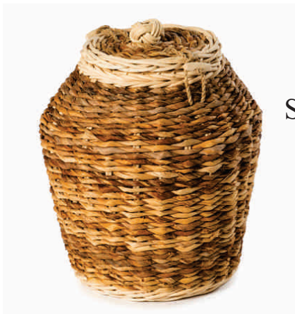
Sunflower ashes casket. Banana leaf woven around a natural cane framework.