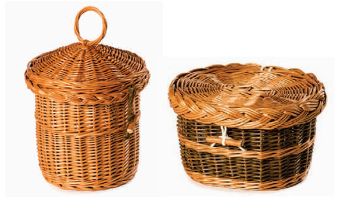
Handcrafted willow ashes casket. Shown here is Bluebell and English Willow Green.