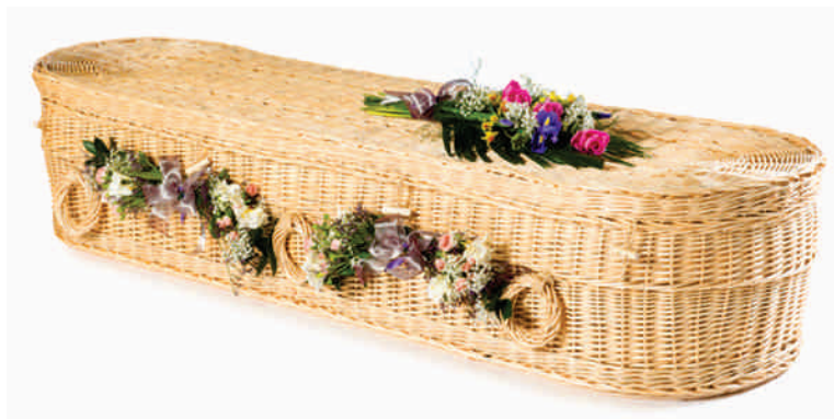
Willow Cromer is a round ended coffin with gently tapered sides handcrafted from Willow. Cromer is available in Natural or Light with woven willow handles and toggle fasteners.