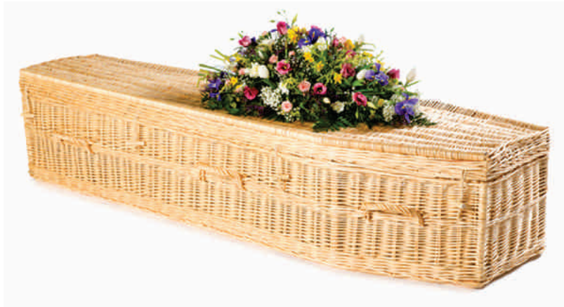
English Willow Highstead is a traditional handcrafted coffin. Highstead is available Light or Natural.