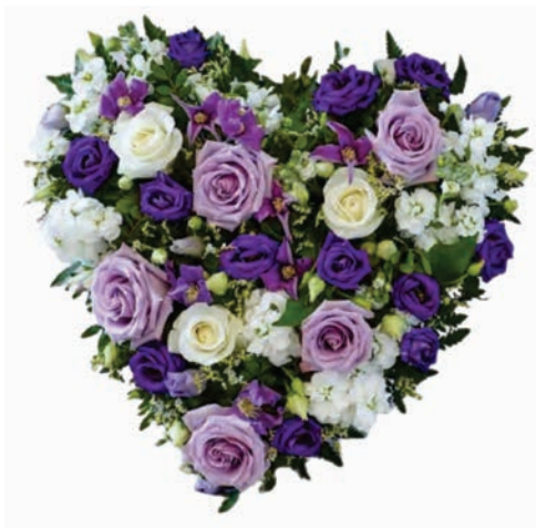
Heart Shaped Spray